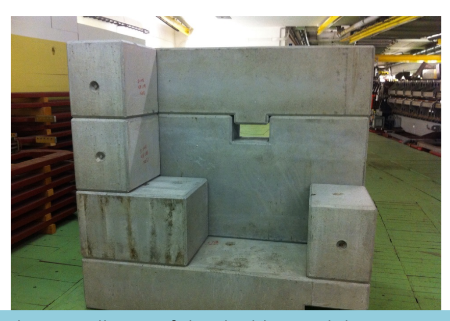
A procedure has been written which describes the complete installation of the shielding and the subsequent installation and alignment of the TPS. The procedure shall be available in EDMS soon.